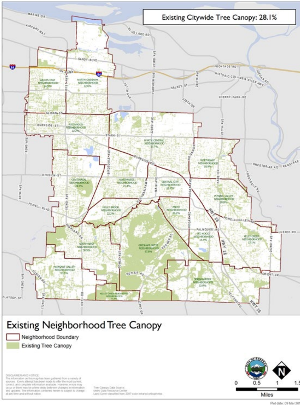
Map 1. Gresham’s Existing Tree Canopy by Neighborhood

cover within their boundaries. By removing the natural areas within these two neighborhoods, as well as other publicly designated natural areas citywide (e.g. Natural Resource Areas), the 28 percent citywide canopy coverage figure is reduced to approximately 22 percent, as shown in Table 2.