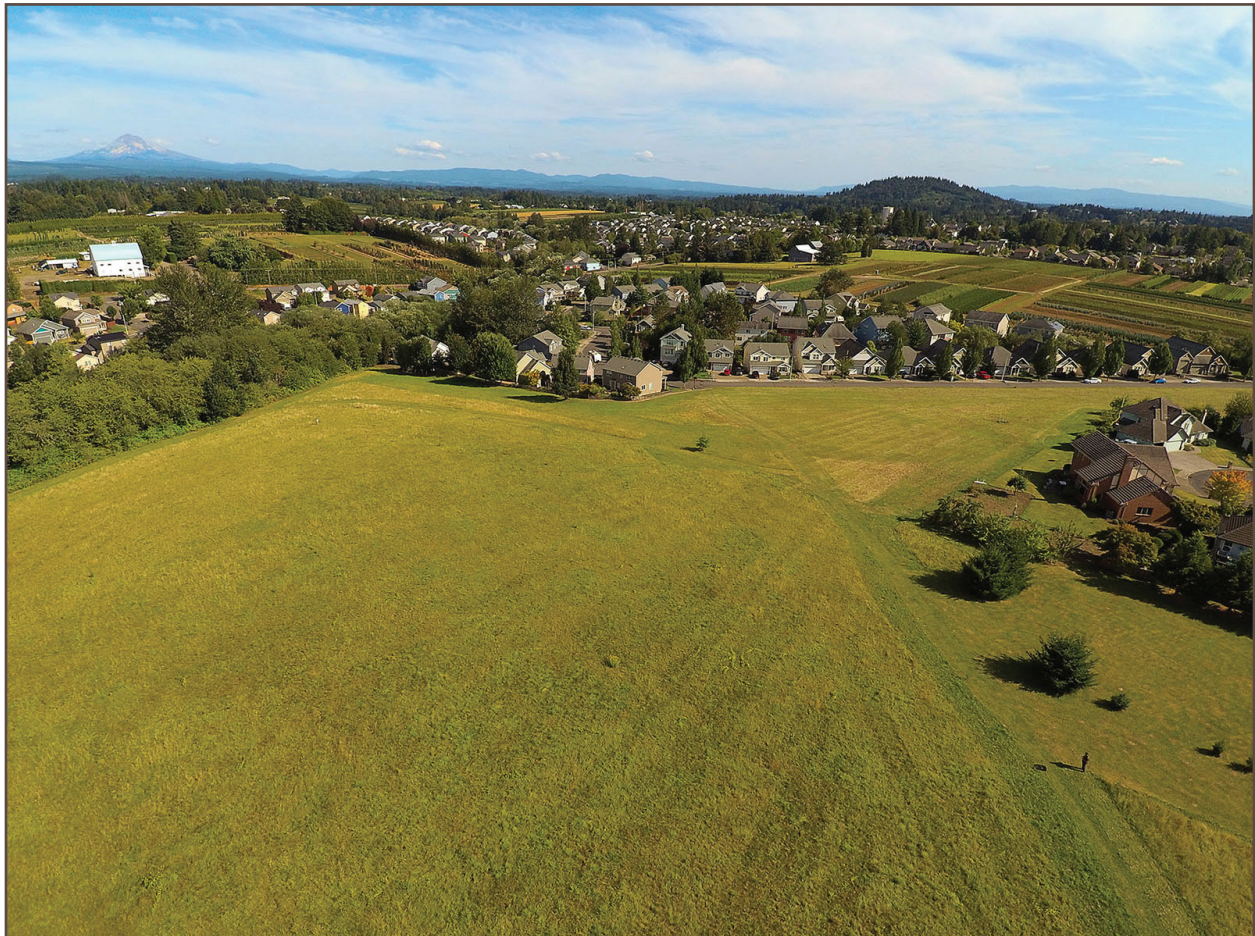
Views to Mountains and Buttes