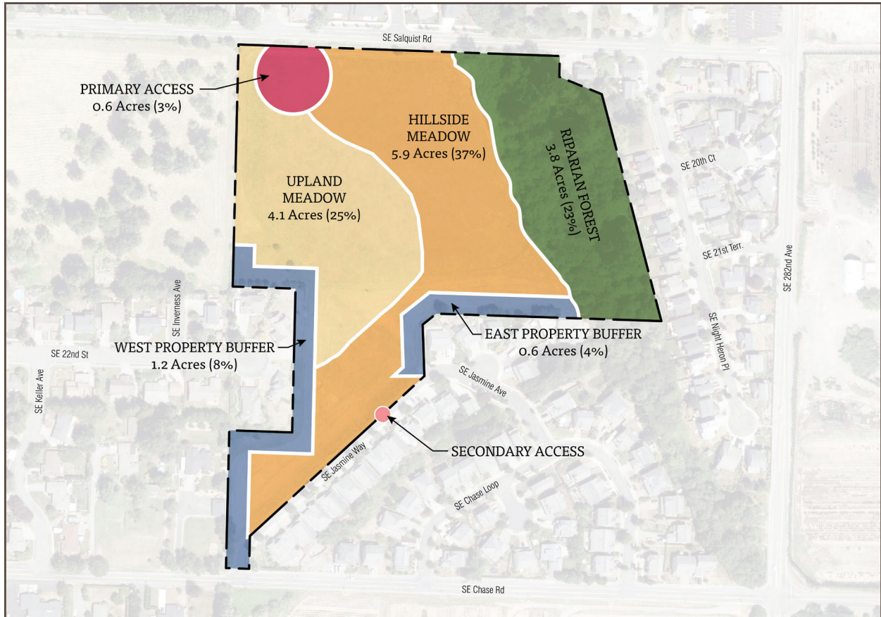
Southeast Community Park - Zones Diagram

Potential amenities were identified for each zone based on their optimal surroundings and the least amount of interruption of natural systems. The range of amenities and their associated zones are as follows: