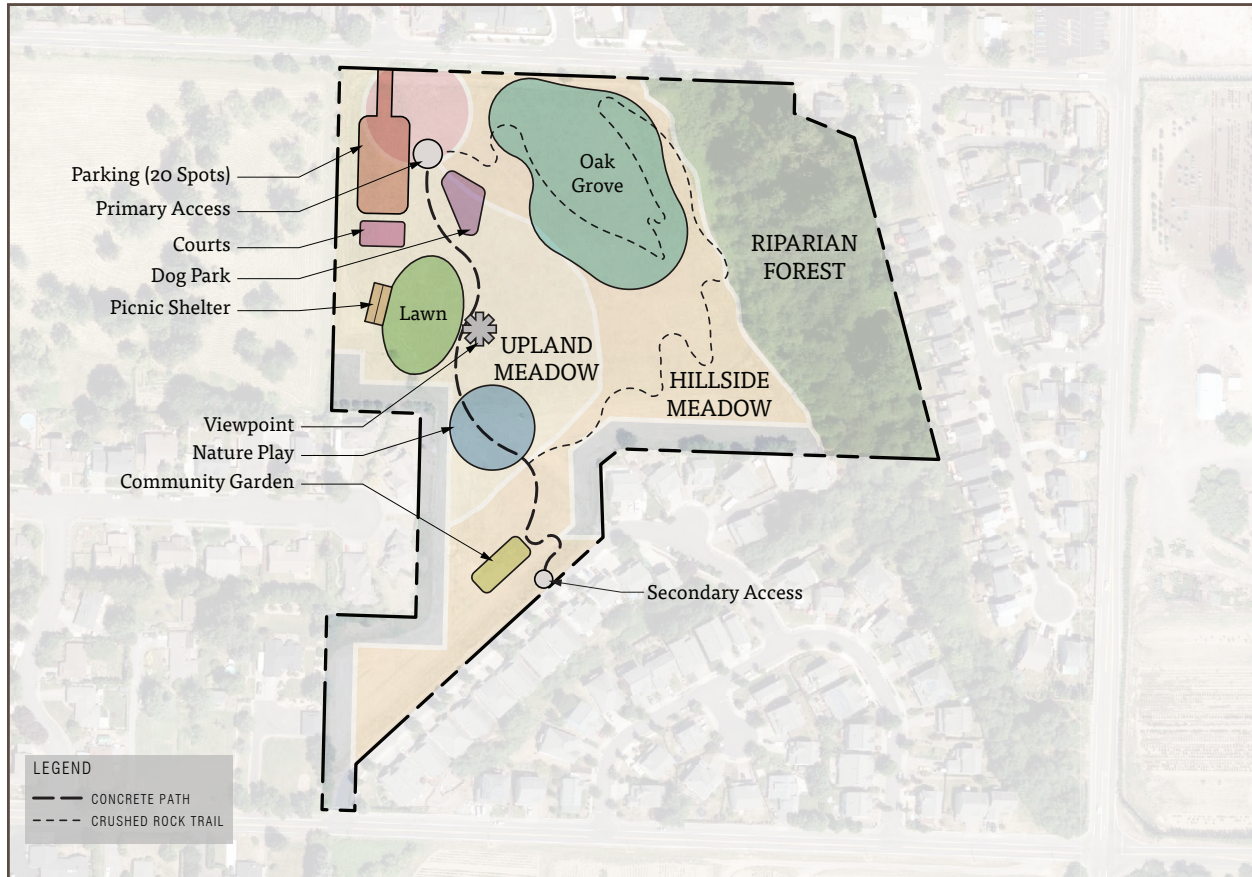
Southeast Community Park - Concept Plan

Based on analysis of the unique existing conditions and feedback on the zones diagram during public engagement meetings, the following concept plan was developed.