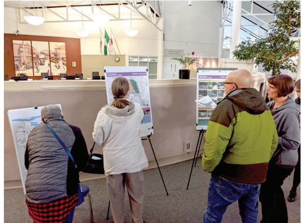
Discussions during Community Open House events