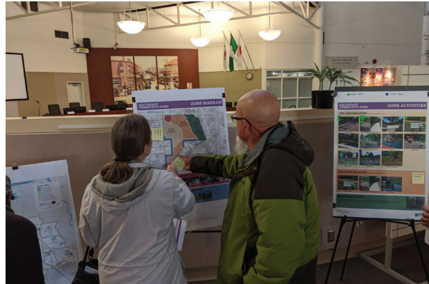
East Side Open House Meeting