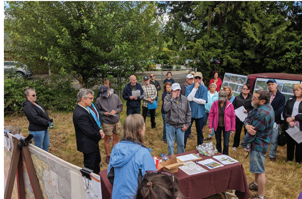
Southeast Neighborhood Park Meeting