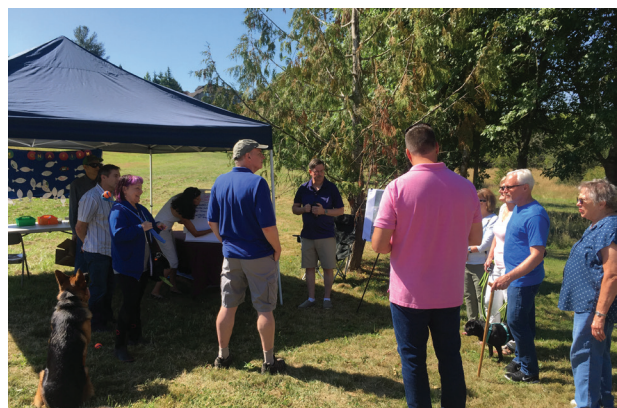
Jenne Butte Neighborhood Park Meeting