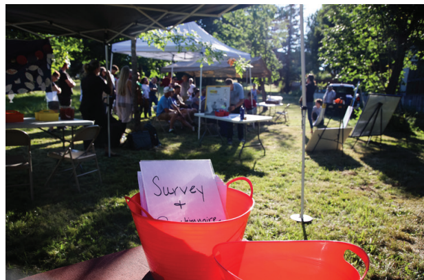
Southwest Community Park Meeting