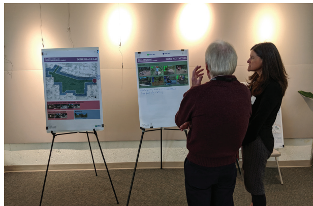
East Side Open House Meeting