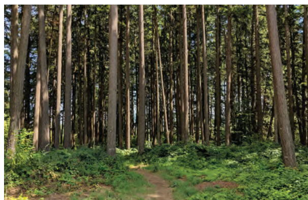
Douglas Fir Grove