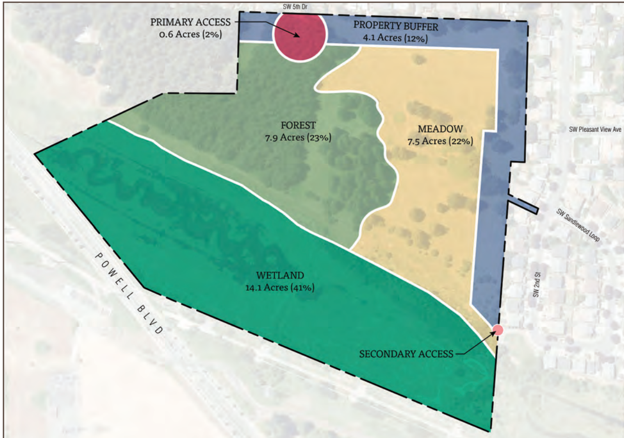
Southwest Community Park - Zones Diagram

Potential amenities were identified for each zone based on their optimal surroundings and the least amount of interruption of natural systems. The range of amenities and their associated zones are as follows: