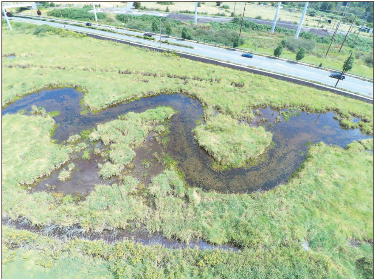
Fairview Creek Headwaters Wetlands