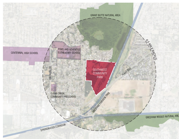
Adjacent Properties Map

This undeveloped community park site is surrounded by low-density residential development and located primarily in the Centennial Neighborhood, bordered by Southwest Neighborhood to the south and both Northwest and Hollybrook Neighborhoods to the east. The park is