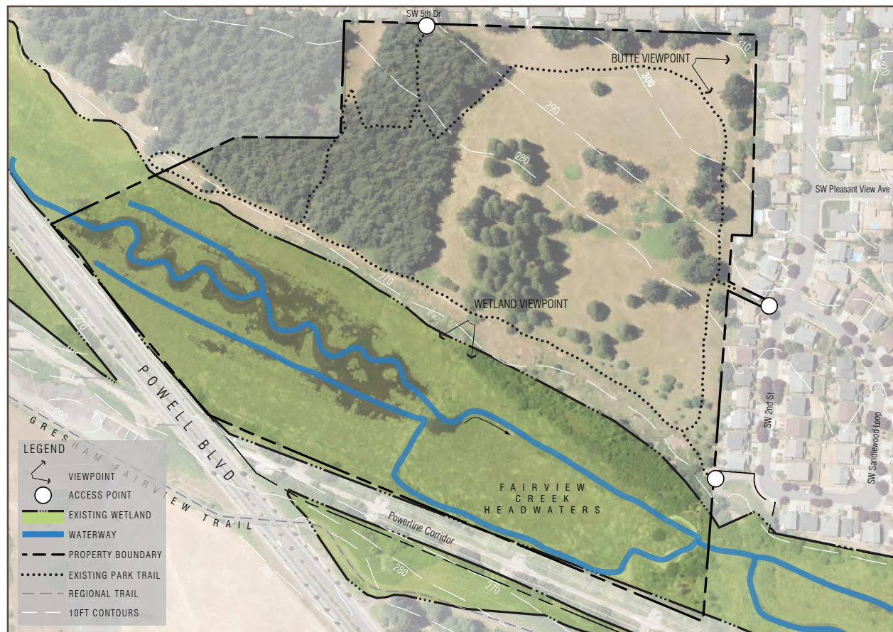
Existing Conditions Plan