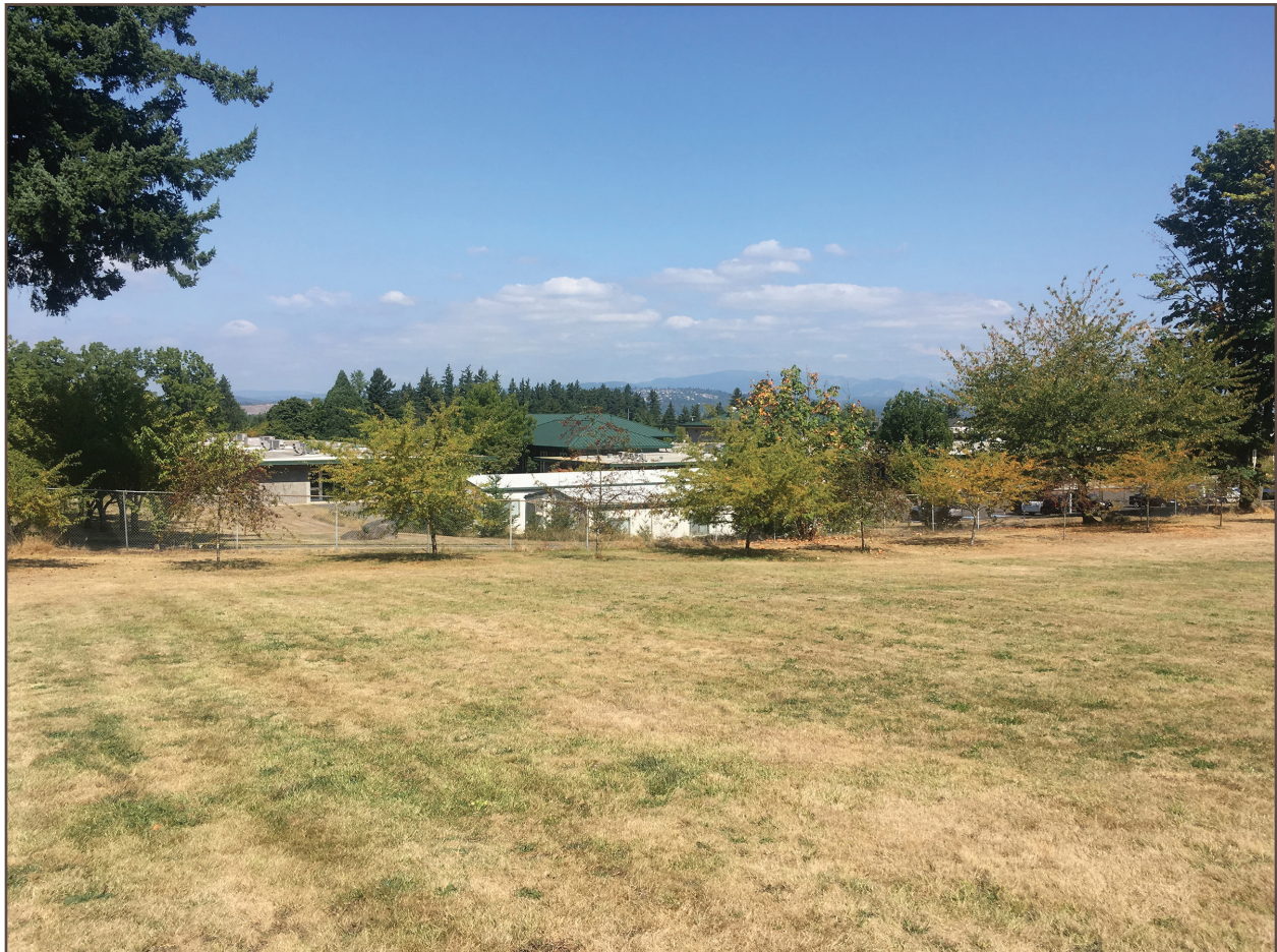
View towards Columbia River Gorge