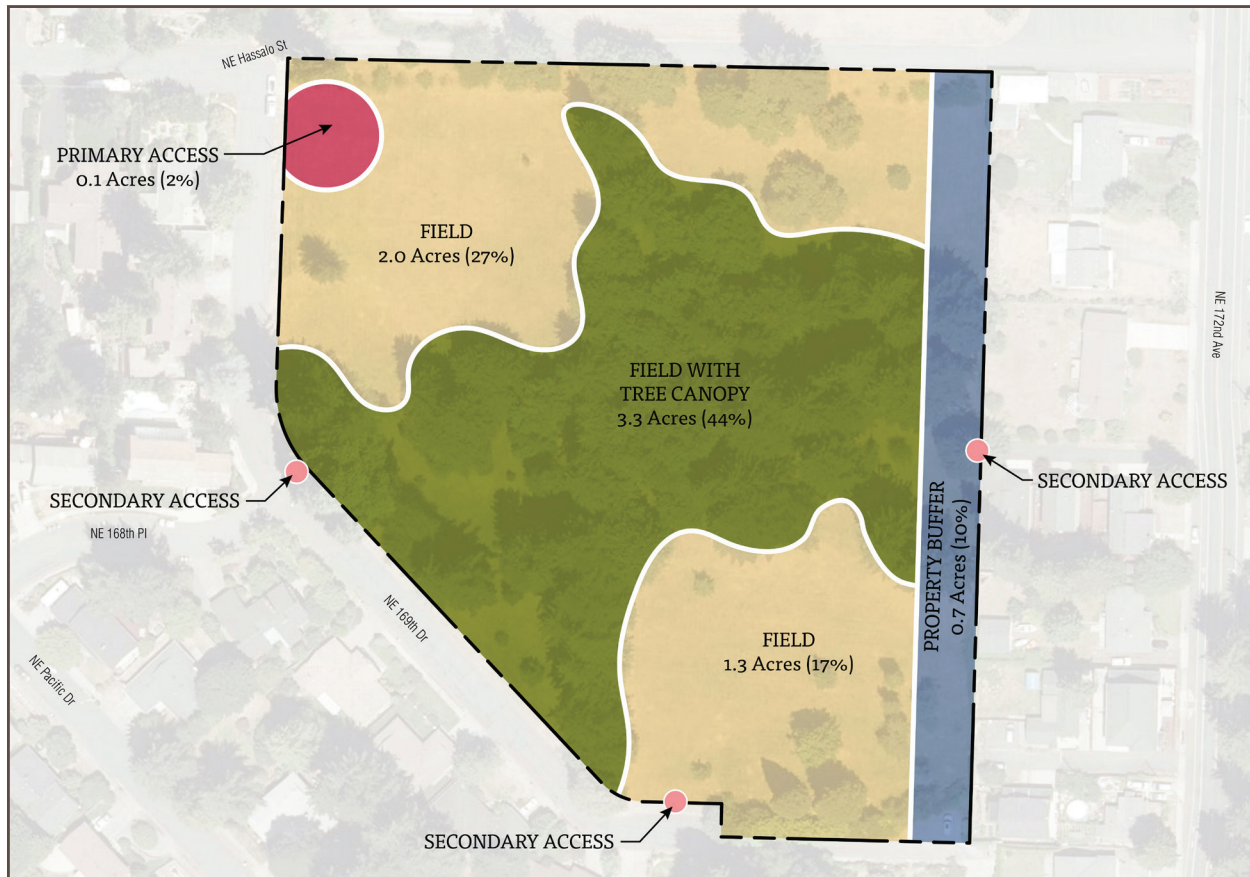
Columbia View Neighborhood Park - Zones Diagram

Potential amenities were identified for each zone based on their optimal surroundings and the least amount of interruption of natural systems. The range of amenities and their associated zones are as follows: