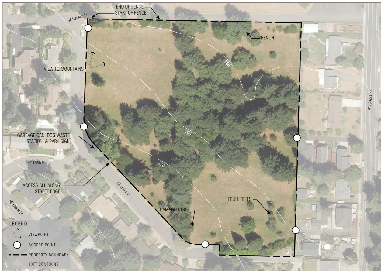
Existing Conditions Plan

There is one existing park bench, a park entry sign, a dog waste station, and a trash receptacle. The entire southwestern and western side of the park along NE 169th Dr. is used for access, as well as a smaller entrance on the east end from NE 172nd Ave. Current usage is mainly passive recreation, with many users walking and playing with their dogs, on and off-leash. The northwest corner of the park provides views towards the Columbia River gorge.