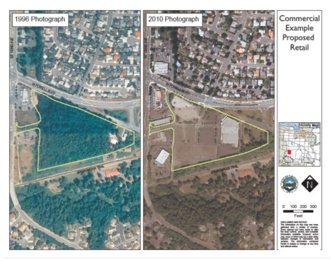
Figure 1. Commercial tree canopy change in Gresham from 1996 to 2010

These changes in land cover, coupled with the City's desire to transition into a more sustainable future, are important reasons why the City should examine how to best preserve the existing natural canopy and manage newly planted trees.