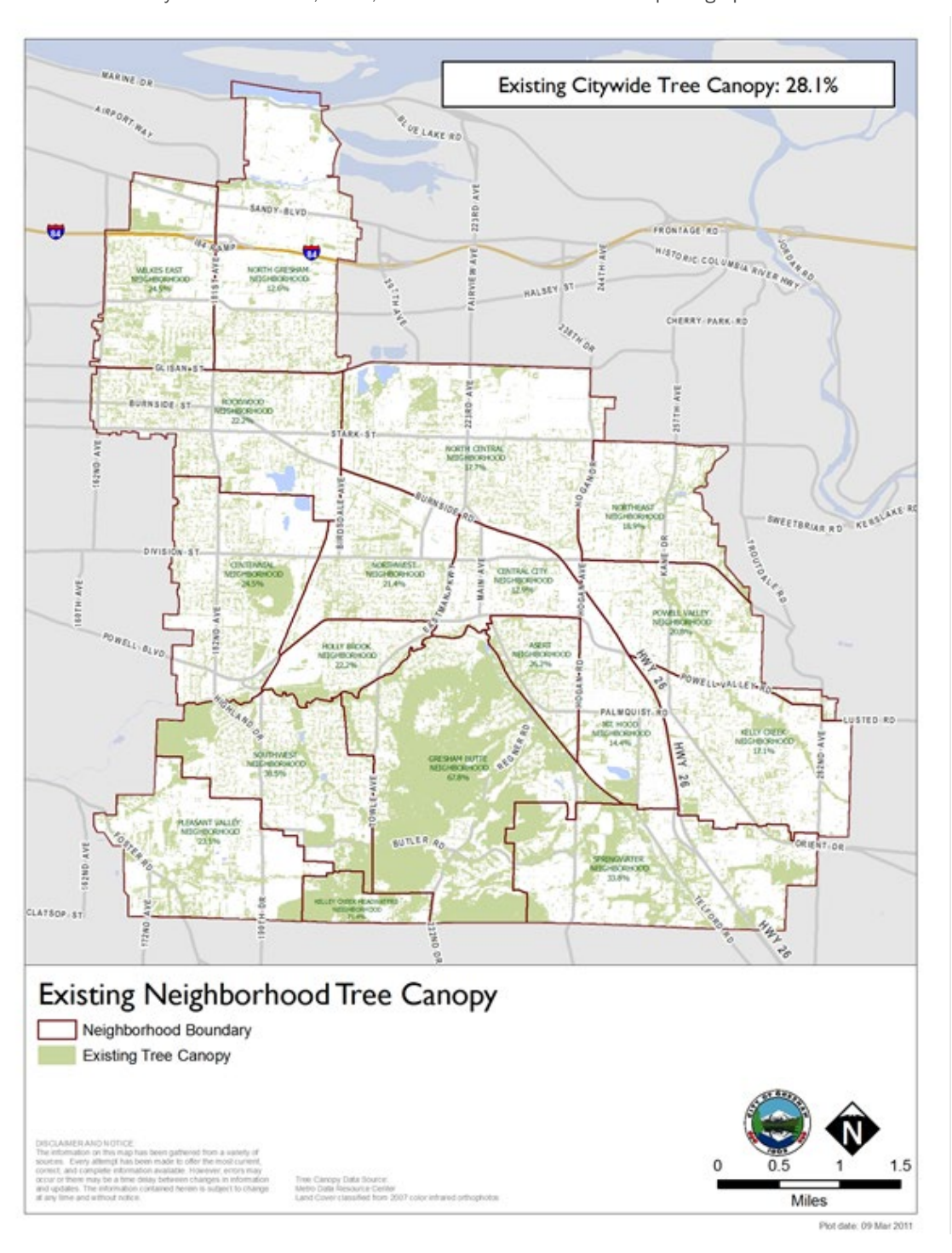
Map 1. Gresham's Existing Tree Canopy by Neighborhood

cover within their boundaries. By removing the natural areas within these two neighborhoods, as well as other publicly designated natural areas citywide (e.g. Natural Resource Areas), the 28 percent citywide canopy coverage figure is reduced to approximately 22 percent, as shown in Table 2.