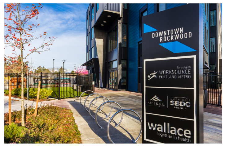
From daycare to workforce training, Downtown Rockwood's Innovation Hub offers resources and services that didn't exist in the neighborhood before.

the District by leveraging over $80 million dollars of public-private investment in Downtown Rockwood to bring daycare, medical services, workforce development organizations, a culturally diverse market hall and stabilizing community based organizations.