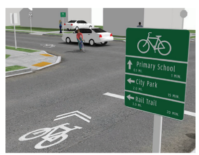
NACTO Urban Bikeway Design Guide

This route takes advantage of one of the few through streets in Rockwood with low traffic volumes and speeds to create bike boulevard facilities. Few vehicles and low traffic speeds make these streets a good fit for signs, pavement markings, and speed and volume management measures to create low-stress bicycle routes.