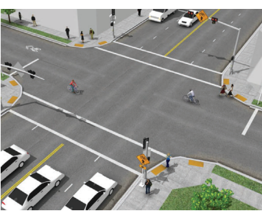
NACTO Urban Bikeway Design Guide

At NE 188th St and NE Glisan St the bike boulevard crosses NE Glisan St, a five-lane arterial. This crossing requires significant safety enhancement. Install Rectangular Rapid Flashing Beacons (RRFBs) per the FHWA Interim Approval IA-11, or Pedestrian Hybrid Beacons (PHBs) per MUTCD Chapter 4F, with corresponding signs and pavement markings. Given the posted speed limit of 40 MPH, Average Annual Daily Traffic (AADT) between 15,001 - 25,000, a crossing length of 65 feet, and the variability of motorist compliance rate to RRFBs, a PHB is recommended. A refuge median island should also be installed.